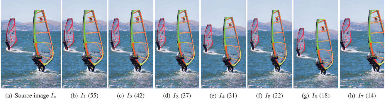
Figure 2. A group in RetargetMe benchmark includes one source image I_s and eight retargeted images \{I_1, I_2, \dots, I_8\} (only seven are shown here, which constitute an illustrative example for effectiveness of global ranking in Section 3.4). The subjective score for each retargeting result is shown in parentheses. In our two-step OQA model, for each retargeting result I_i , i = 1, 2, \dots, 7 , the original representation v(I_i) , the feature vector after NPE transformation f(v(I_i)) , the relative score \tilde{F}(f(v(I_i)), f(v(I_j))) and the ranking value r_i are presented in Table 1.