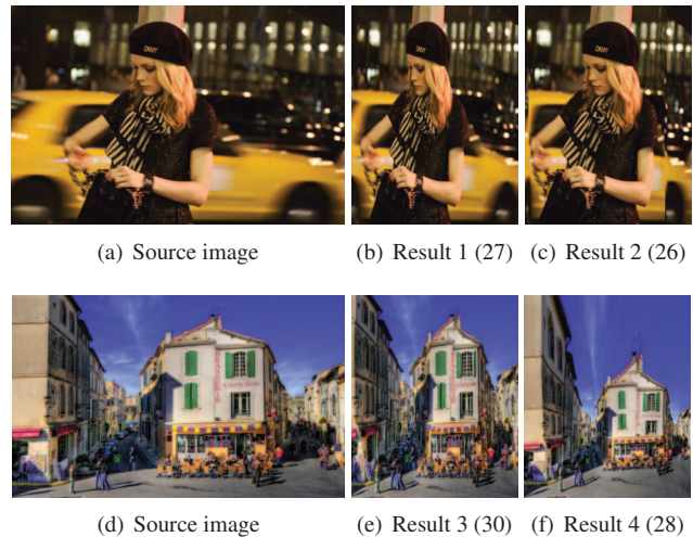
Figure 1. Subjective scores are only comparable for retargeting results of the same source image. In each row, two retargeting results are presented and their scores are shown in parentheses. These scores provided in RetargetMe benchmark [25] are numbers of votes that people cast when comparing this image against other images. Higher scores mean better results. Although the scores of the two retargeting results in (e) and (f) are higher than the scores in (b) and (c), we cannot conclude that the results in (e) and (f) are better than the results in (b) and (c); instead, the opposite appears to be true.

Image retargeting refers to techniques that adjust a source image into different sizes, which has become an increasingly demanded tool with the diversification of display devices. Although a large number of retargeting methods have been developed, a single method that works well on any image still does not exist [12, 33]. Subjective quality assessment involving human judgment is usually time-