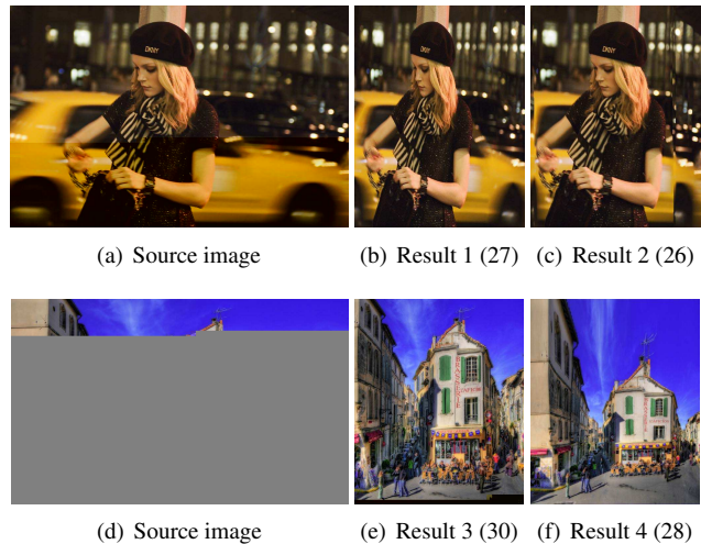
Figure 1. Subjective scores are only comparable for retargeting results of the same source image. In each row, two retargeting results are presented and their scores are shown in parentheses. These scores provided in RetargetMe benchmark [25] are numbers of votes that people cast when comparing this image against other images. Higher scores mean better results. Although the scores of the two retargeting results in (e) and (f) are higher than the scores in (b) and (c), we cannot conclude that the results in (e) and (f) are better than the results in (b) and (c); instead, the opposite appears to be true.

Image retargeting refers to techniques that adjust a source image into different sizes, which has become an increasingly demanded tool with the diversification of display devices. Although a large number of retargeting methods have been developed, a single method that works well on an image still does not exist [12, 33]. Subjective quality assessment involving human judgment is usually time-