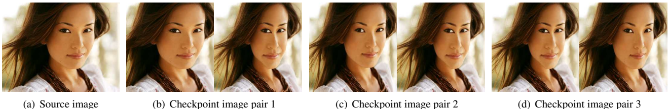
Figure 3. Three check point pairs. In (b) and (c), retargeted images on the left are obviously better than those on the right. In (d), the retargeted image on the right is obviously better than the one on the left.

these seven metrics is over-simplified and our machine learning framework can learn a better predictor from human preference;